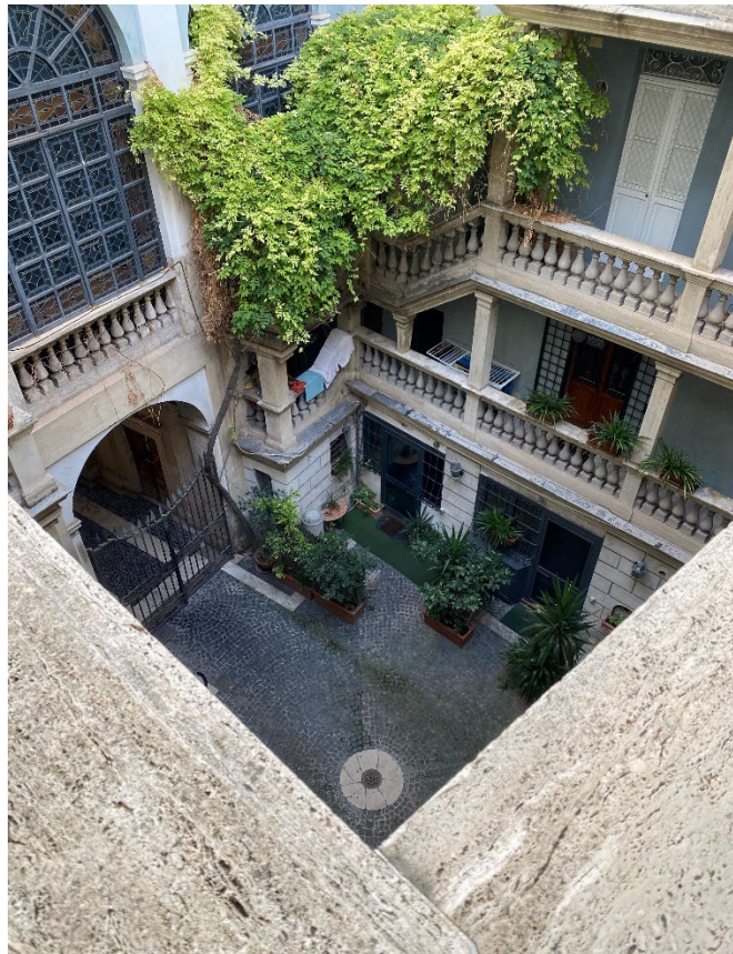
Figure 1 The office courtyard

At the beginning of the internship, I joined a team that carried out international projects, especially in China. Working in a collaboration with Chinese studio and clients allowed me to gain valuable insights into intercultural communication and collaboration in architecture. Furthermore, I was able to collaborate with architects and designers from different backgrounds, which enhanced my understanding of the importance of teamwork in achieving successful architectural outcomes. The first project I have joined was the Hengfu Urban Development proposal, which was a competition about urban development and revitalization of the Old French Concession area in Shanghai. The project was ongoing during my internship, and I had the opportunity to contribute to the design process by generating various conceptual drawings, diagrams, and perspectives for the client presentations. Since it was an ongoing project I have mostly helped with the visualization and development of the details of the masterplan. Moreover, the project was a part of the exhibition at the venue in Shanghai and was presented to the local community and city administration.