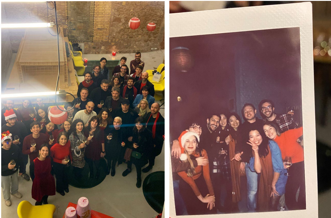
Figure 6 Office Christmas party

During my internship I gained valuable experience in teamwork, architectural design, and visualization, developed Grasshopper skills, and expanded my knowledge of large-scale architecture projects. This internship provided me with the opportunity to collaborate with international design teams and apply my skills in architectural design, visualization, and sustainable design principles. The internship experience provided me with a well-rounded understanding of the architecture studio work environment, the pros and cons of working in a big international firm, and the importance of effective communication and teamwork in delivering successful architectural projects. Furthermore, I have been offered to continue my work at the firm as a Junior Architect after the completion of my internship, which is a testament to the positive impact I had during my time there. Overall, my internship experience was incredibly valuable as it allowed me to work on high-profile projects, develop my skills in architectural design and visualization, and gain insight into the dynamics of an international architecture firm.