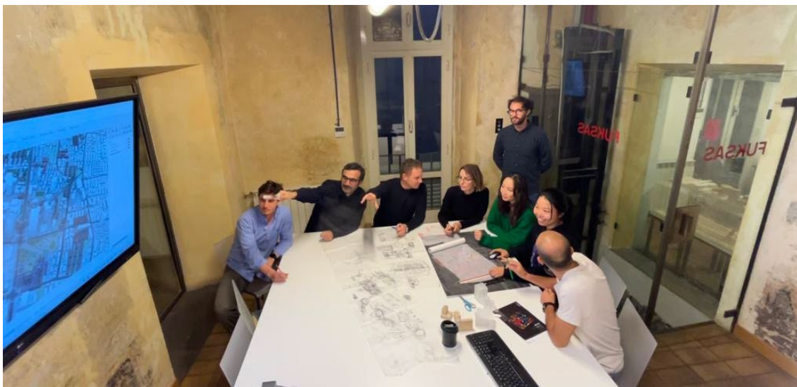
Figure 5 Meeting for project discussions

In addition to my professional experience, I also had valuable experience working in an international environment and participating in the office activities such as team meetings, design reviews, and occasional Friday gatherings. During my internship, I have managed to develop close relationships with my coworkers who became good friends and mentors, and we continue to stay in touch even after the completion of my internship. My day would start with arriving at the office early in the morning and updating my task list for the day, around 11 am me and some of my coworkers would have a coffee break in the nearby cafe and discuss our current projects and share the daily news. At lunchtime, we would gather again to have lunch together and take afternoon coffee. Overall, I can describe the environment in the office as friendly and inspiring, with a strong emphasis on collaboration and learning from each other's expertise.