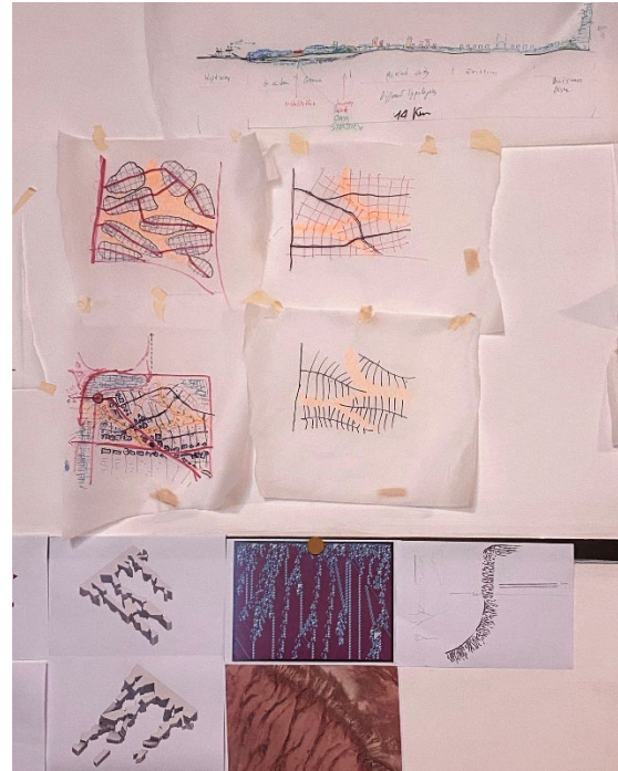
Figure 4 Sketches and Project development drawings

Some of the ideas could look very conceptual and abstract, and afterwards with the effort of designers would be translated into architecture.