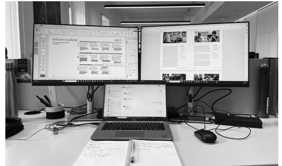
Typical workspace at Arup, Milan with natural light, ample room, and dual screens to ensure the work environment is optimal, efficient and comfortable.