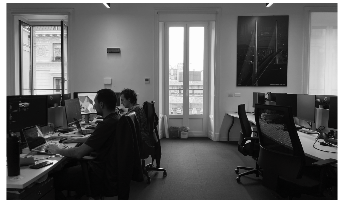
Office bay and the view