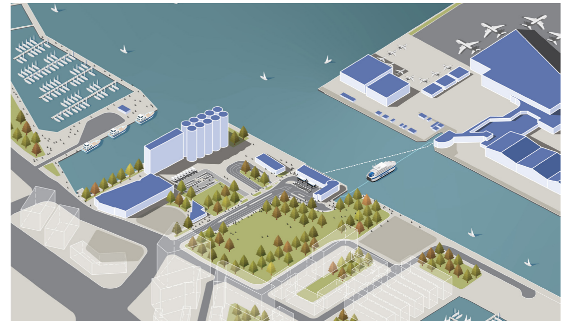
The isometric base of the Billy Bishop airport entry point with the ferry terminal, the illustration helped overlay the strategic planning scenarios.