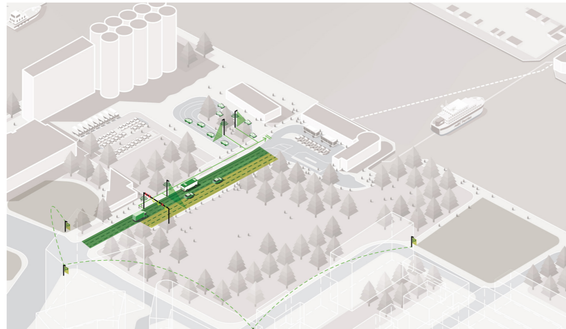
Isometric showing ICT solutions such as access control system, dynamic lane management, dynamic parking management using progressive charging (ie. dynamic pricing)