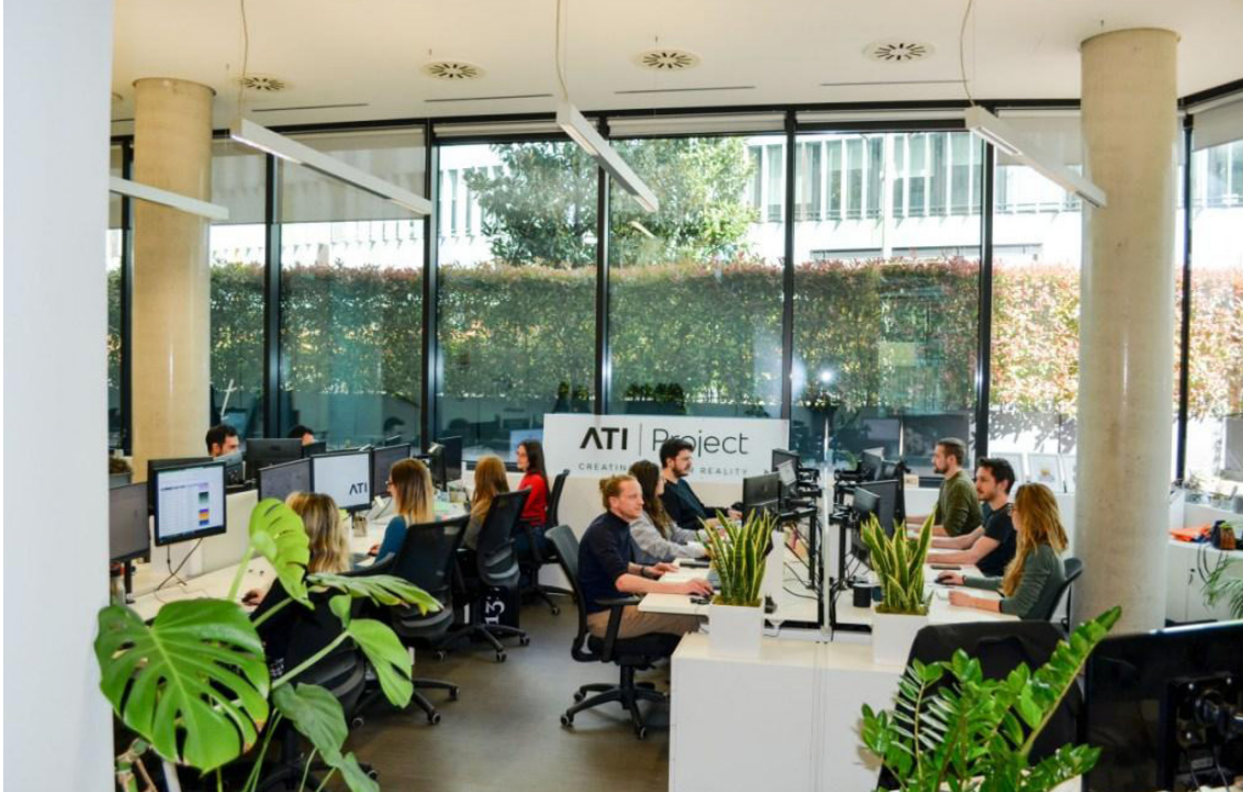
ATI Project Milan Office, via Imbonati 18 (Maciachini Station)