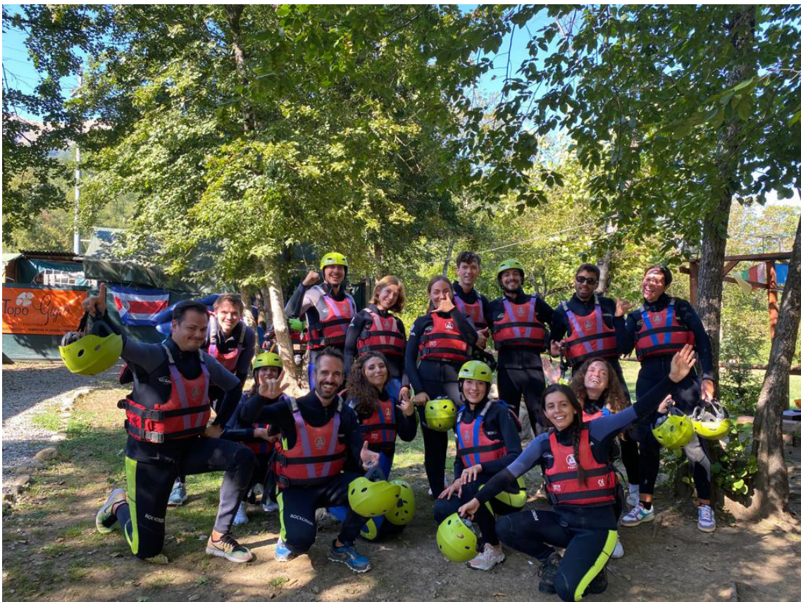
Tenders Team Building, September 2023, Lucca, Italy