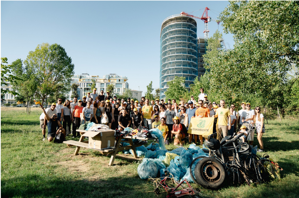
Summer Volunteering for Legambiente, July 2023, Pisa, Italy