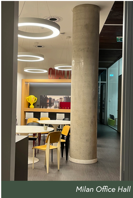
Milan Office Hall

One of the best parts of my internship experience was related to the office lifestyle and social life.